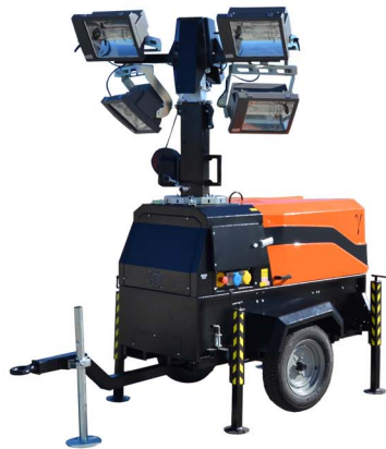
LT 8500 HA