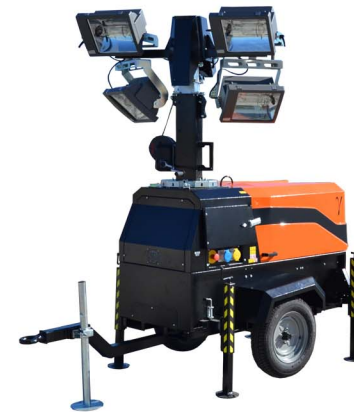
LT 8500 LED