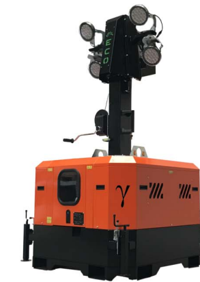
Full Electric 36H