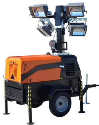
LT 8500 MH